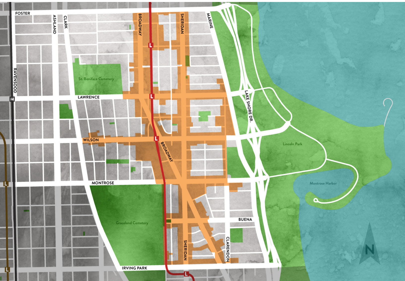
Uptown SSA #34 Boundary Map

For more information on Uptown SSA #34, visit www.exploreuptown.org or call (773) 878-1064.